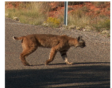
Bobcat

year with javalina being fed and becoming so tame they were walking up to people to beg for food and were becoming aggressive if you did not have any food to give. The Arizona Game and Fish Department have issued notices to residents who con-